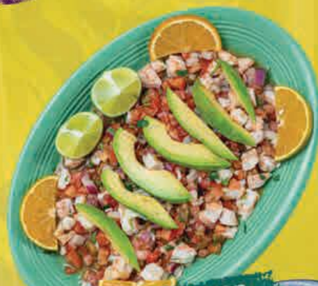
Ceviche de Camaron