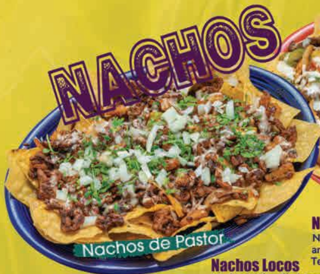
Nachos de Pastor

Nachos de Pastor Nachos with marinated pork, pineapple, topped with cheese sauce and shredded cheese, garnished with fresh onion and cilantro. 16.99