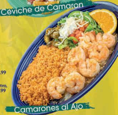
Camarones al Ajo