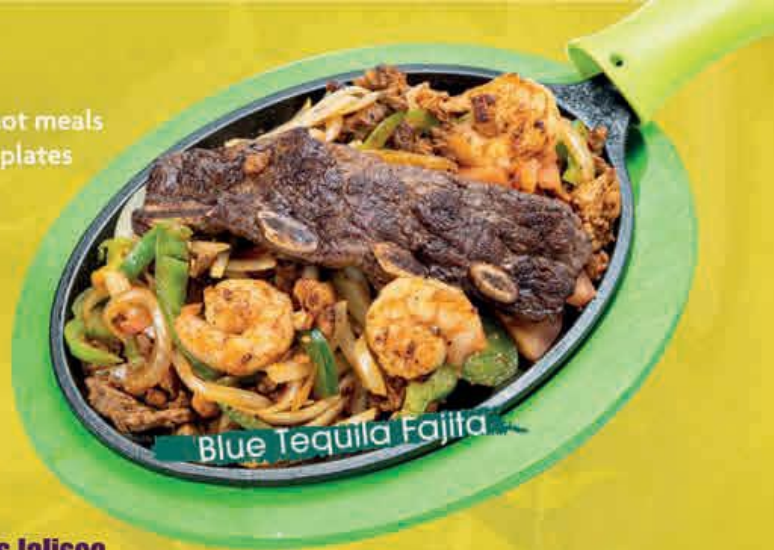
Blue Tequila Fajita

Tender strips of marinated chicken, steak or mixed, grill onions, green bell peppers and tomatoes. Single 17.99/Double 33.99