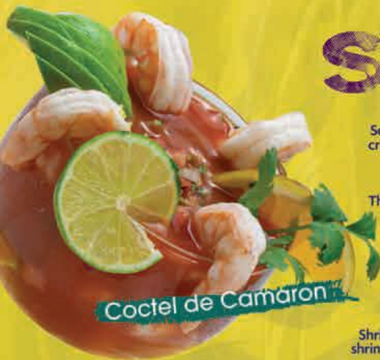
Coctel de Camaron

Shrimp, onion, spicy lime green sauce, cucumber, and sliced avocado, served cold with chips. 19.99