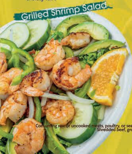
Grilled Shrimp Salad

Crispy flour tortilla bowl filled with beans and your choice of ground beef, shredded beef or shredded chicken, topped with romaine lettuce, tomato, guacamole, and shredded cheese. 13.99